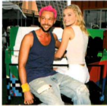
Chris Benz and Jessica Stam